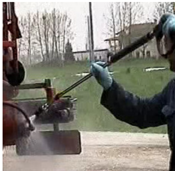
DUAL SPEAR 15°

It can aspire water from any type of sources and pump it until the 130 bar pressure.